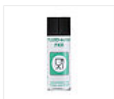
Item no. 721 400